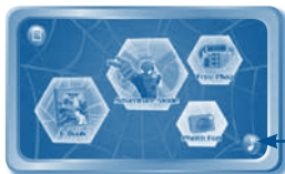
Music On/Off icon

To turn the background music on or off, touch the Music On/Off icon on the cartridge menu.